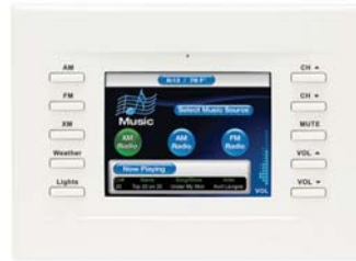
Crestron's new Adagio Touch Panel

On my way back from Indianapolis (see show report opposite) I spent the day visiting Crestron in New Jersey. Since I was last there around five years ago, their facility has grown around five-fold. The tour of the company encompassed visits to their R&D department, manufacturing plant and warehouse. I was with a couple of other UK dealers and some of the guys from Crestron UK who were equally impressed with the whole set-up.