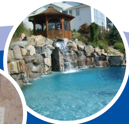
Above: George's swimming pool

The house included most of what we normally do with our own larger house systems, just being American it tended to be a little bigger. In the basement there is a superb home cinema, games room and a music room. The outdoor pool is absolutely beautiful and includes a number of discrete external speakers. The Crestron system takes charge of all the lighting, heating, aircon, security, music and entertainment throughout the house.