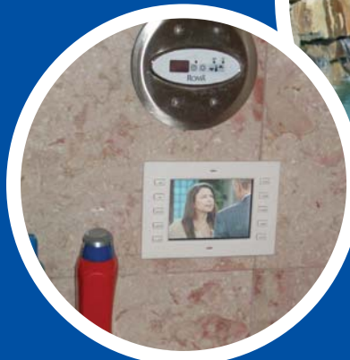
Left: the steam room / shower with a Crestron in-wall touch panel which can also be used as a video monitor