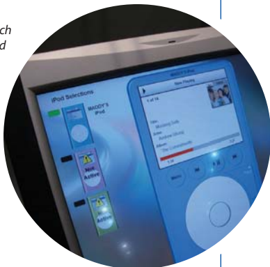
A Crestron touch panel with iPod user interface which mimics the iPod

The new Mythos Gem compact loudspeakers from Definitive Technology are the latest and smallest in the Mythos range. They are ideal for those who want quality performance without intrusion in their living space. The new range comprises the Mythos Four, a small tower speaker; the Mythos Five, a compact tower; the Mythos Seven to act as a centre channel loudspeaker and the Mythos Solo, a single enclosure housing the left, centre and right speaker and the compact Gem.