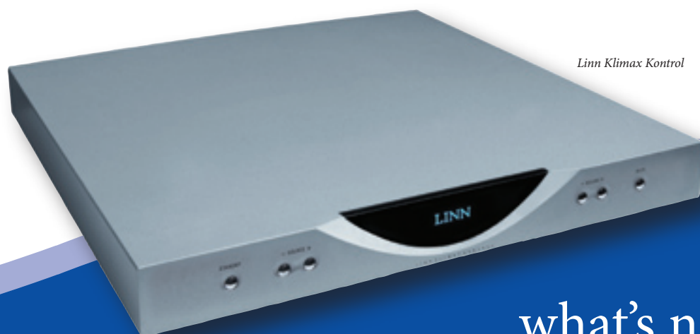
Linn Klimax Kontrol

Please submit your answers by post or email comp@grahams.co.uk