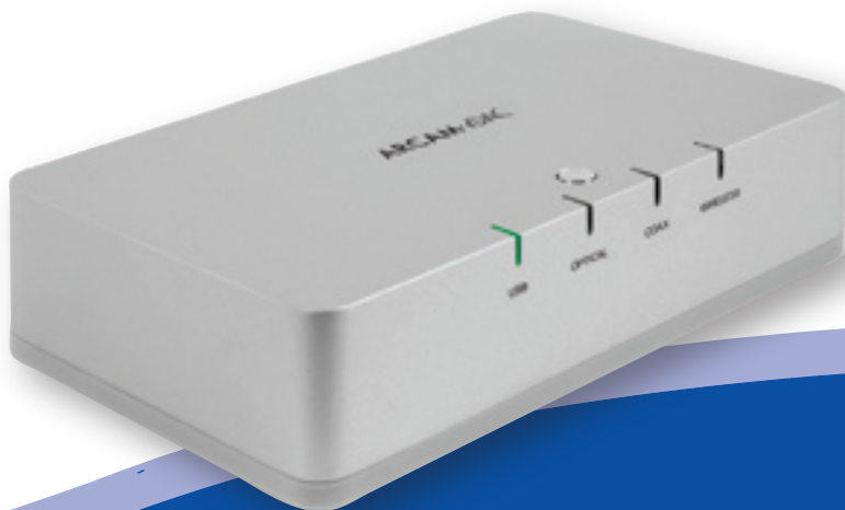
The Arcam rDAC

Arcam are also releasing a version of the rDAC that will allow you to wirelessly stream music from your PC using the Klear Wireless technology included in their new rCube. All that is necessary is an rWave wireless Dongle available optionally at roughly £90. The rDAC costs £300 and is available now.