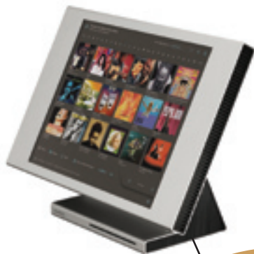
Meridian Control 15