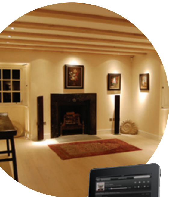
The lighting and hi-fi are controlled by the iPad

We can fully support the Meridian Sooloos system, the Cisco data network, the Lutron lighting system and even the Panasonic IP based phone system from our London base. The end result is a beautiful home which has been enhanced with with 21st century technology.