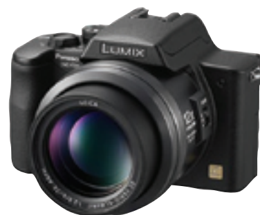
Win a digital SLR camera

The closing date is 1 st August 2005. Good luck!