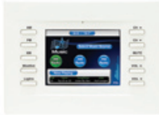
Crestron's new Adagio Touch Panel

On my way back from Indianapolis (see show report opposite) I spent the day visiting Crestron in New Jersey. Since I was last there around five years ago, their facility has grown around five-fold. The tour of the company encompassed visits to their R&D department, manufacturing plant and warehouse. I was with a couple of other UK dealers and some of the guys from Crestron UK who were also equally impressed with the whole set-up.