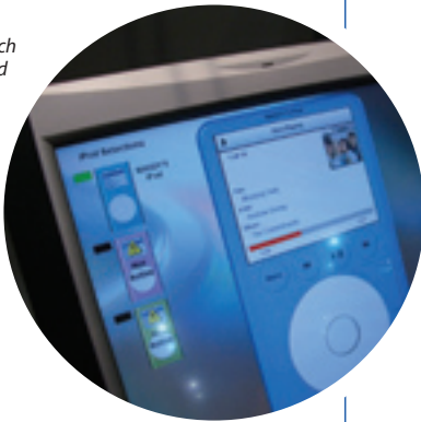
A Crestron touch panel with iPod user interface which mimics the iPod

The new Mythos Gem compact loudspeakers from Definitive Technology are the latest and smallest in the Mythos range. They are ideal for those who want quality performance without intrusion in their living space. The new range comprises the Mythos Four, a small tower speaker; the Mythos Five, a compact tower; the Mythos Seven to act as a centre channel loudspeaker and the Mythos Solo, a single enclosure housing the left, centre and right speaker and the compact Gem.